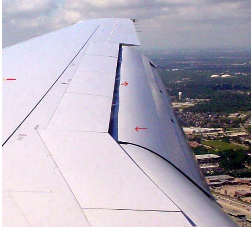
Photo 3. Stress fracture on 757 outboard flap fully deployed for landing

Note that in this enlarged and enhanced photo the fracture, due to the lighting, does not appear as a black line as in the previous image. It appears as a distortion resembling a wrinkle. This subtle feature is best seen on a monitor screen and may not be evident when printed.